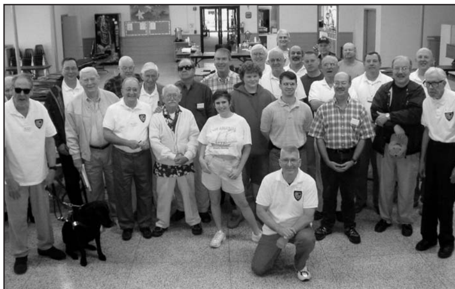
Many of the Brothers at St. Paul's By the Sea in Jacksonville, Florida.

Household repairs have also been made for church members unable to do the work themselves.