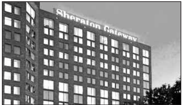
The exterior, above, and the lobby, below, of the Sheraton Gateway Hotel, 2009 Sullivan St. on the south side of Atlanta's Hartsfield-Jackson International Airport.